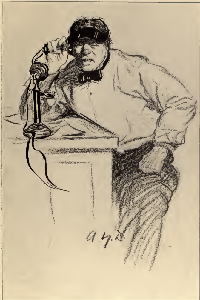
A round-headed man in his shirtsleeves comes into view.